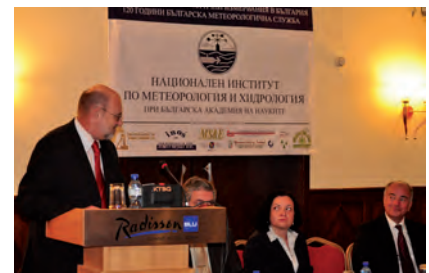
EMS President delivering the EMS address

in Sofia were taken over by Bulgaria and this date is considered as the birthday of the Bulgarian Meteorological Service.