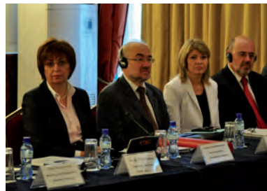
Vice-Chair Bulgarian National Assembly, WMO Secretary-General, Bulgarian Minister for the Environment, EMS President

best wishes of the European meteorological community to these important anniversaries.