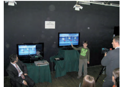
Workshop on how to become a TV weather forecaster

Different workshops aimed at school children, students and the public were held in parallel with the lectures.