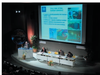
Opening Session: Key note lecture by the Secretary General of WMO (P. Pichard)

The theme of the conference was High resolution meteorology - applications and services, and the key note lectures during the opening session highlighted different aspects of the theme.